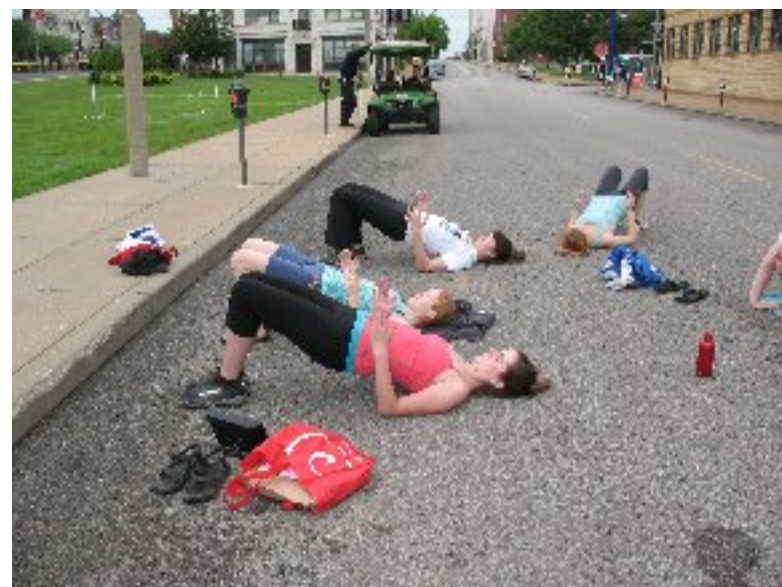
Yoga class during Open Streets

The Mayor's Office organized the event. However, this program would not be possible without the support of the St. Louis Metropolitan Police Department, the Special Events Department, the Department of Streets, the Department of Health, and the Department of Parks and. Boeing, Great Rivers Greenway, YMCA of Greater St. Louis, Trailnet, Grand Center for Art and Life, and Saint Louis Regional Bicycle Federation are also among the sponsor list.