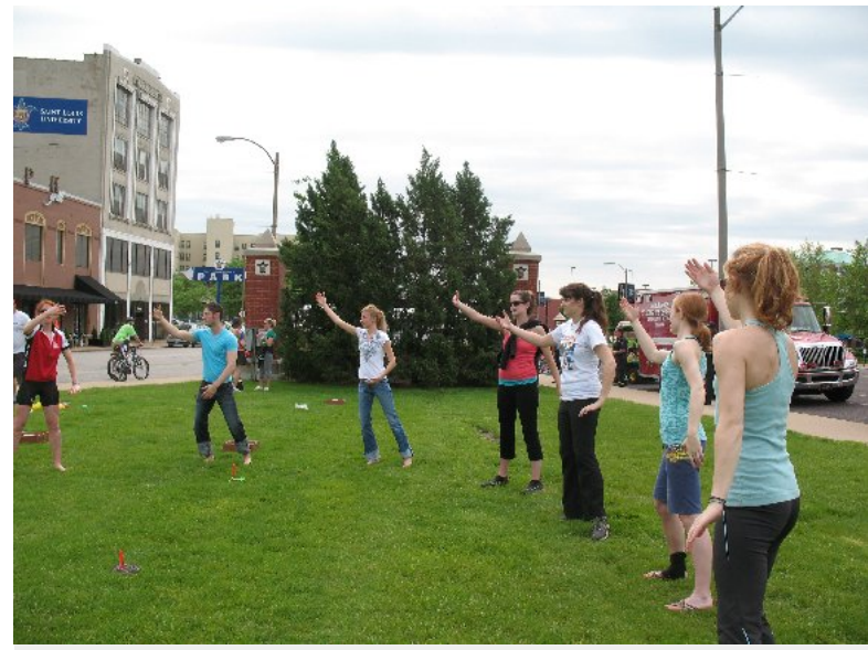
Taichi Class during Open Streets