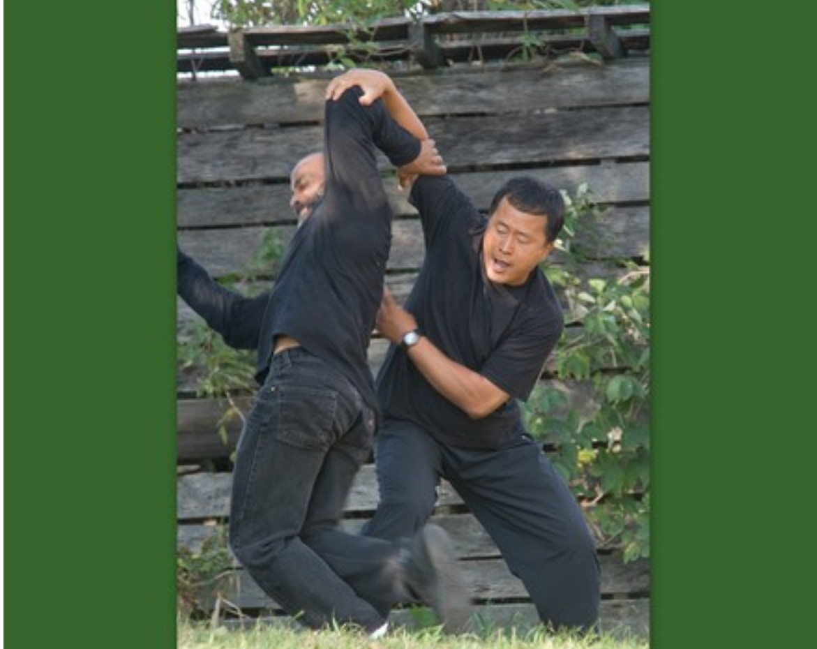
True Tai Chi