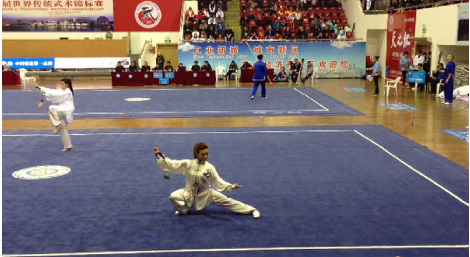
Win-Win Kung Fu Cultural Center